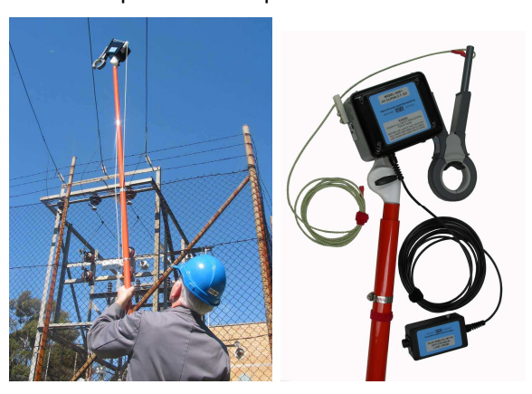
Optically isolated current clamp on the end of an insulated hotstick

High Voltage: Optically isolated clamp used to measure up to 1200 Amps on 100kV lines.